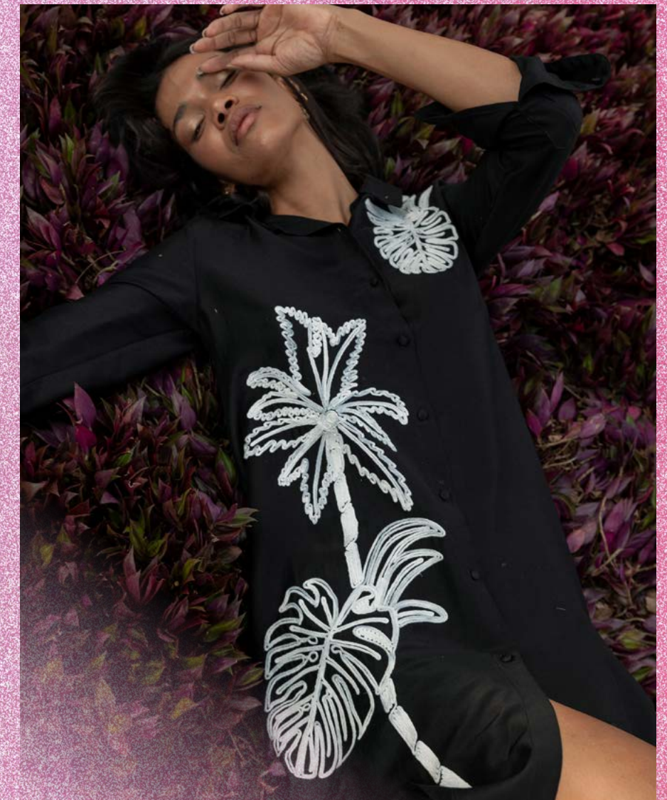
Nay Sunset Wear