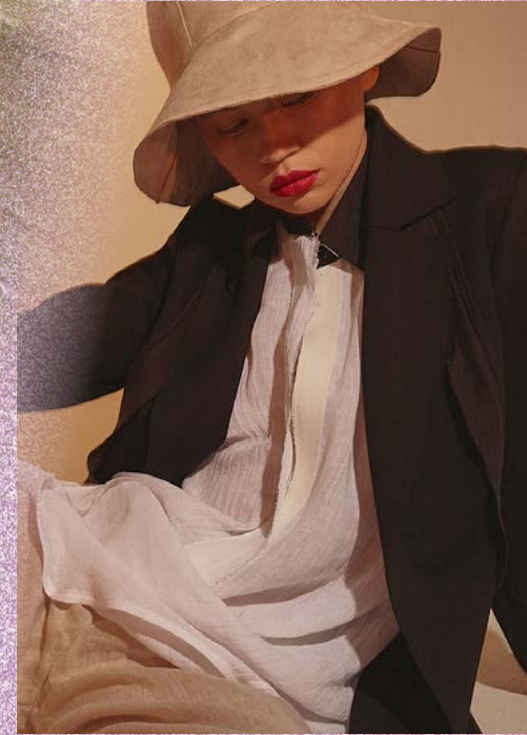
Maison Marie Saint Pierre