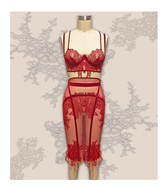
Sheer illusion bra & control-slip skirt w/ applique lace by Chelsea Vega, Fashion Design BFA '20