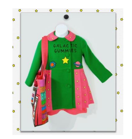
'Galactic Gummies' coat + 'Space Junk' tote bag by Courtney Rivera, Fashion Design BFA '20