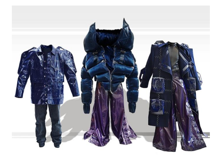
Memoirs of an Annamite Collection featuring handlebar trench coat and six-pack puffer coat by Naythan Nhat Hai Doan, Fashion Design BFA '20