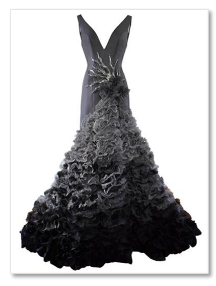
Cool gray silk gazaar gown with ombré ruffled slit skirt by Jaimie Fernandez, Fashion Design BFA '20